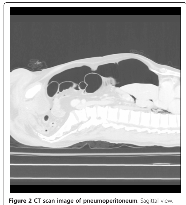
Figure 2 CT scan image of pneumoperitoneum. Sagittal view.

results for smaller perforations, like those resulting from therapeutic colonoscopies (e.g. polypectomy), as opposed to those caused by diagnostic colonoscopies [17]. These patients should receive intravenous fluids, keep absolute bowel rest and they should be treated with intravenous broad-spectrum antibiotics. If the conservative treatment is successful, the patient's general condition should