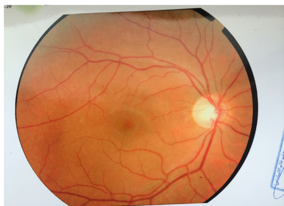
Figure 2 Complete absorption of macular hemorrhage after three months in Valsalva retinopathy.

The prognosis for patients diagnosed with merely Valsalva retinopathy is generally good and the condition requires only close observations. Vision usually returns to normal over a short period of time, from weeks to