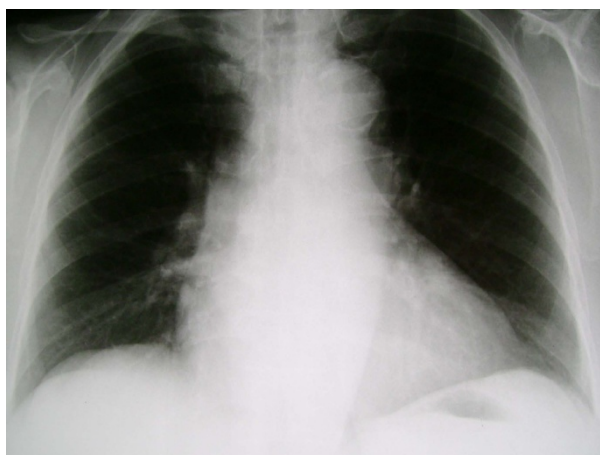
Figure 3 Upright posteroanterior chest radiograph just before the patient's discharge. No subdiaphragmatic free air is noted bilaterally.

In women, pneumoperitoneum after rough sexual intercourse or after Jacuzzi usage has also been reported because the air can also be transmitted to the peritoneal cavity through the vagina and saplings [1]. Laparoscopic or endoscopic procedures (colonoscopy) may cause iatrogenic SP [1].