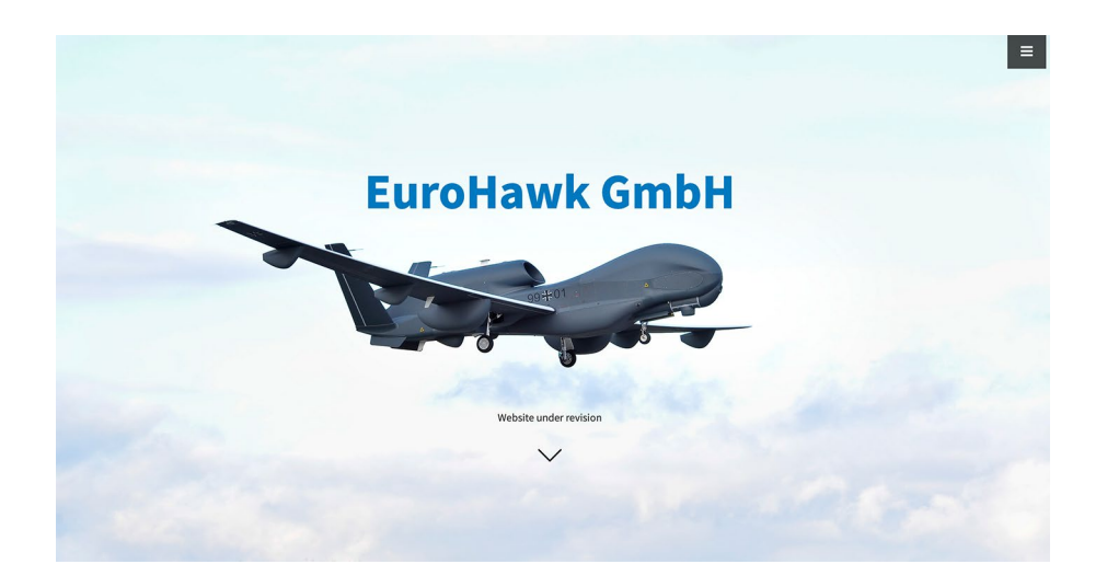
Fig. 3 EuroHawk GmbH, Website under revision, Source: Eurohawk.de, Screenshot: http://www.eurohawk.de/

Hawks, falcons, and eagles are the subject of taming known under the terminology of falconry which earlier also used to be called hawking ( al-ṣiqāra is one of the names in the Arab tradition). Those powerful birds of prey have long military careers in many different traditions, especially falcons and hawks. Twentieth-century birds of prey have also been tasked with military roles far beyond airfield clearance or martial symbolism. In the Second World War, falcons for example were mobilised to capture pigeons and their post, and today, they carry sensors and cameras for monitoring on a global scale (Macdonald 2006, 158).<sup>27</sup> However,