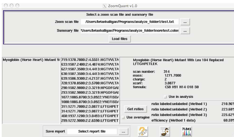
Figure 1. ZoomQuant main window displays the proteins and peptides identified by the peptide identification program and the data for individual scans. The user can choose individual proteins and scans to analyze. The user also has the option to perform ratio calculations and generate a report for the experiment.

theoretical isotope distribution. To determine the area of the unlabeled species, A_0 , the areas of peak M and M+1 are added to the calculated area contributed by the unlabeled species to peaks M+2 , M+3 , and M+4 .