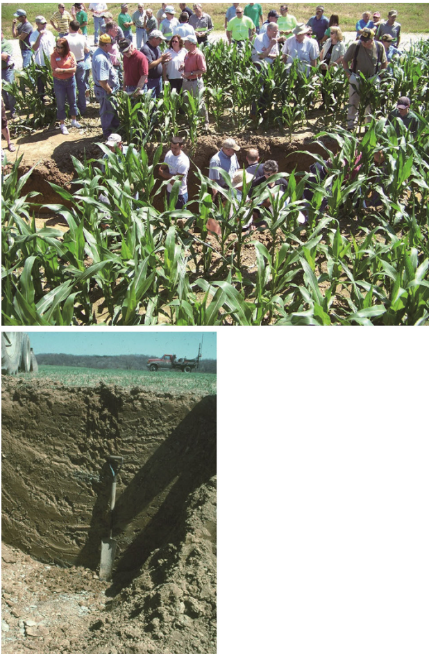
Fig. 5 Reclamation of prime farmland must replace the soil horizons and produce yields equal to yields on adjacent undisturbed sites under the same management

result, most prime farmland reclamation includes separate removal of A/E, B, and C soil horizons, with separate storage piles if they are not moved directly to reclamation areas. Soil replacement is done in the correct order and with similar depths (Fig. 5). Because of the legal requirement to restore agricultural productivity on prime farmlands, it is essential that soils be replaced in a manner that does not cause excessive soil compaction, when possible. Otherwise, compacted soils should be loosened using physical means. Lime, fertilizer, and mulch should be applied as needed to establish vegetation, and vegetation should be established as quickly as possible.