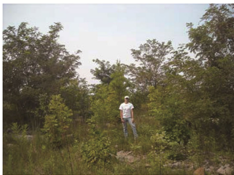
(c) Tree growth after planting on such sites 6 years