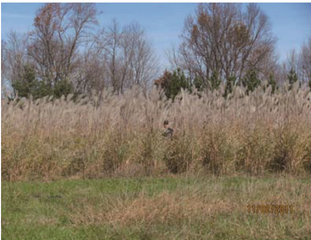
Fig. 9 Switchgrass and Miscanthus growth on surface mines on the Eastern USA surface mines

global food demands. Hence, researchers are examining other biofuel feedstock options. Many perennial herbaceous plants have been evaluated as sources for cellulosic materials