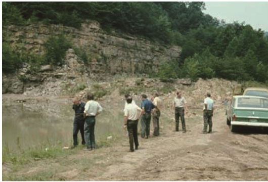
(a) Highwall on a West Virginia contour mine