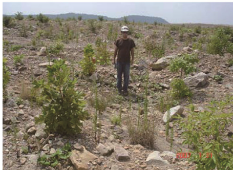
(b) Tree growth after planting on such sites 2 years