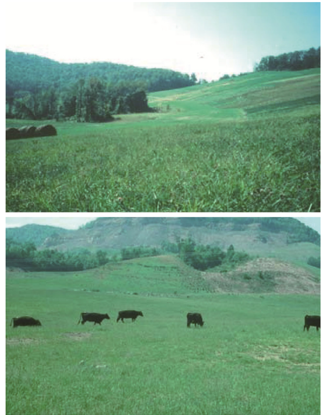
Fig. 6 Hay land and pasture post-mining land uses on coal mined lands reclaimed under SMCRA

Many mined areas in the eastern USA are capable of supporting highly productive forage crops for livestock if reclaimed and managed for that purpose (Fig. 6; Ditsch and Collins 2000). Even mined lands in western areas that