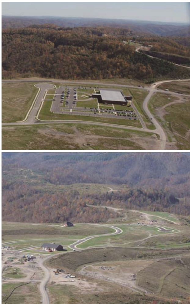
Fig. 10 Commercial and residential post-mining land uses must ensure stable land surfaces and no mass movement of materials for structures to be safe

industrial, commercial, and residential development. Other important factors include the reclaimed mine site's access to water, utilities, and waste disposal. Surface stability for the building development area can be achieved by using common-sense procedures that are well supported by engineering practice (Zipper and Winter 2009).