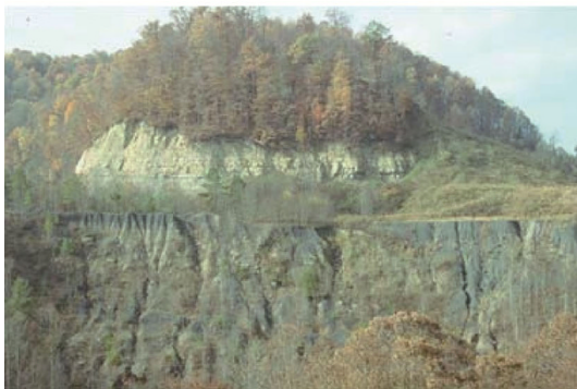
(c) An acidic outcrop and highwall left by a pre-law contour mining in Virginia