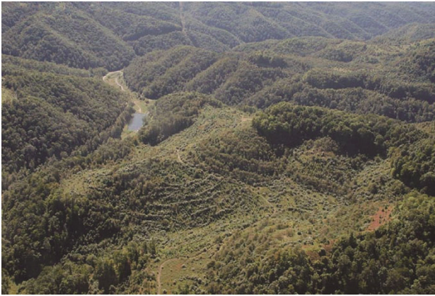
Fig. 8 Wildlife habitat designs include rows of shrubs and trees across the mine site to encourage wildlife movement across the area. The plant species also provide food and shelter