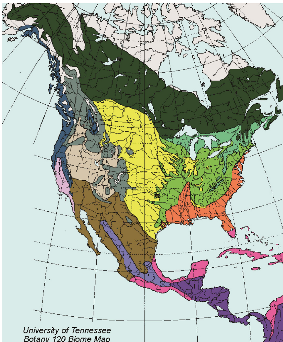
Fig. 1 Forests in North America. The Mixed Deciduous Forest is shown in light green

The Eastern USA surface mined areas are predominantly forested landscapes (Figs. 1, 2). The climate and soils/geology of the central Appalachian Mountains are conducive to some of the best hardwood forest growth in the world (Hicks 1998). The climate is continental with cold snowy winters especially at high elevations to warm, humid summers. Average precipitation varies from 200 cm at high elevations to 100 cm toward the western part of the region. The geology is sedimentary; most of the rocks are sandstone, siltstone, and shale, with inter-bedded coal seams. The strata are generally flat-lying, with most sedimentary beds oriented within a few degrees of horizontal.