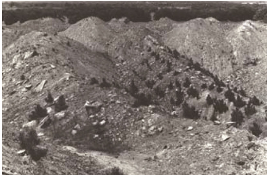
(b) Spoil ridges left by an Ohio Area mine