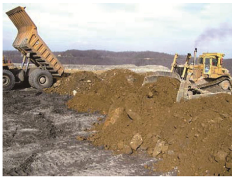
(a) Placement of brown topsoil up to 1.5 m in depth