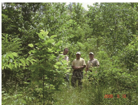
(d) Tree growth on such sites 15 years