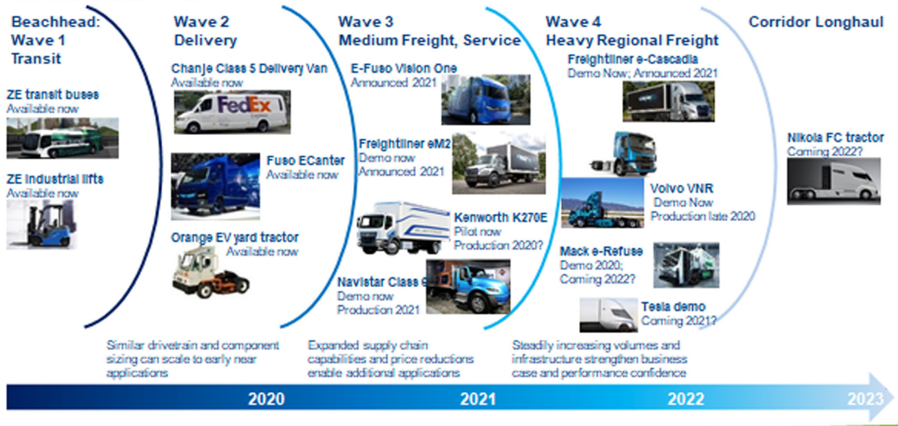
Fig. 3 Timeline of new electric medium- and heavy-duty vehicles with makes and models. Used from CALSTART, with permissions. [31, 32]

Framework for Change: Zero-emission vehicles will come in waves – global "beachhead" strategy targets applications where zero-emission technology will succeed first