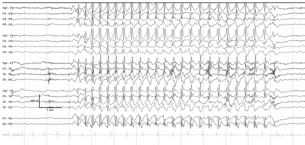
Fig. 1 A typical absence seizure on electroencephalogram, characterized by 3 Hz generalized spike wave discharges, with abrupt onset and offset, lasting several seconds

Other important elements of history include other seizure types, developmental history, and age of onset. Other seizure types (for example, generalized tonic–clonic, myoclonic, or atonic) may distinguish a diagnosis of CAE from other epilepsy types in which absence seizures might be prominent (such as myoclonic astatic epilepsy in a young child, and juvenile myoclonic epilepsy in an older child) [5]. Development is typically grossly normal in a child in CAE, though comorbid attentional deficits or other subtle behavioral or cognitive impairments might be present at onset [6, 7]. In a child with early onset absence epilepsy (onset under the age of 4 years) or a child with absence seizures and an abnormal neurologic exam or substantial developmental impairments, considering the possibility of an underlying diagnosis of glucose transporter 1 deficiency syndrome (GLUT1 DS) is particularly important because more targeted therapy, specifically the ketogenic diet, can be pursued [8]. A similar but distinct syndrome where absence seizures predominate is juvenile absence epilepsy (JAE), which occurs in children 10–15 years old and is characterized by less frequent absence seizures (sometimes occurring a few times daily or less than daily) as well as the occurrence of generalized tonic–clonic seizures in 80% or more of children with the disorder [9].