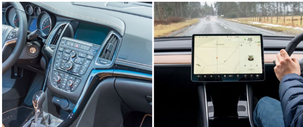
FIGURE 2 HMI concepts in classic (left) and maximally reduced form (right)

The time people spend in a car accounts for only a small portion of their daily time. Thus, the majority of their interaction preferences are formed outside the vehicle. On current smart devices, their preferences are saved by means of digital profiles. The current evolutionary step in a digital device ecosystem lays in synchronizing initiated activities across all of the users' devices. Users authenticate with their profile ID and do not need to make any further settings on a device before using it for the first time. Already today, this is orchestrated by Apple and