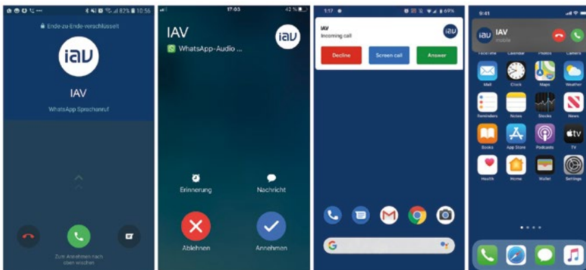
FIGURE 3 Example of the spread of requirements regarding “intuitive usability,” illustrated by the use case of “incoming phone call”: UI expectation, depending on the operating system used (Android versus iOS) and technology chosen (cellular telephony versus voice-over IP)

One anticipates that flexibly formable, intelligent, morphing multi-functional interfaces have the potential to gradu-