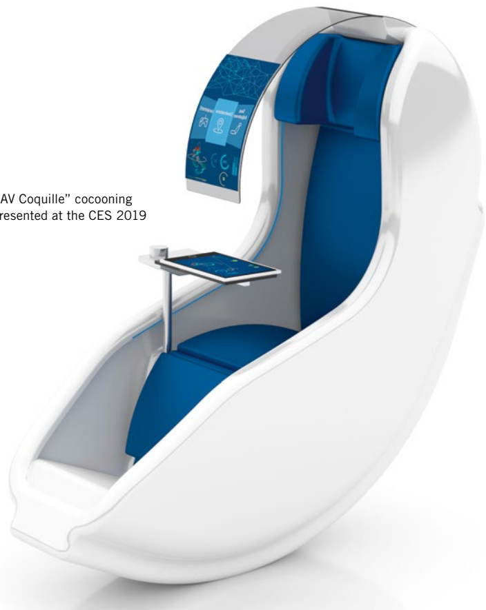
FIGURE 4 "IAV Coquille" cocooning concept, presented at the CES 2019

Ever since the first car has been built, there was the intention to make the car HMI driver-oriented. HMI functions were developed and implemented separate from one another; the HMI was a part of the car. So far, the concept of a "one-size-fits-all" HMI was accepted by the