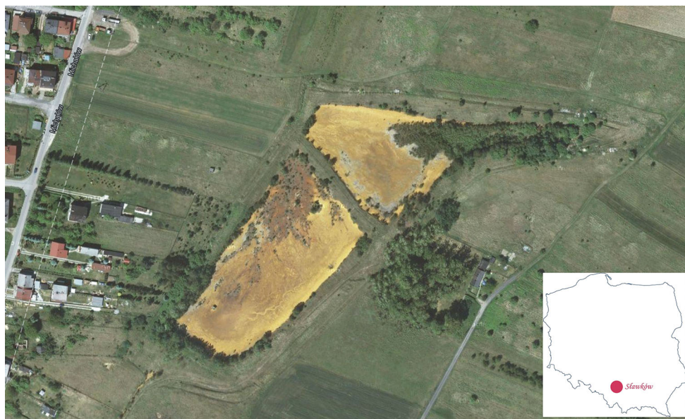
Fig. 1 Satellite image of lagoons with deposited waste

procedures were employed: in situ pH measurements, mineralogical composition, total chemical analysis, heavy metals content analysis, aqueous and toxicity characteristic leaching procedure (TCLP) leaching tests and measurements of waste radioactivity. Total chemical analysis of waste was performed according to EN 196-2:2006 method. To determine heavy metals concentration in waste, samples were dried in 105 °C, digested with 65 % HNO 3 in the START D microwave (Milestone Srl, Italy) according to EPA SW 3051A protocol and then were analyzed using dual atomizer atomic absorption spectrometer Unicam ICE 3500 (Thermo Scientific, China).