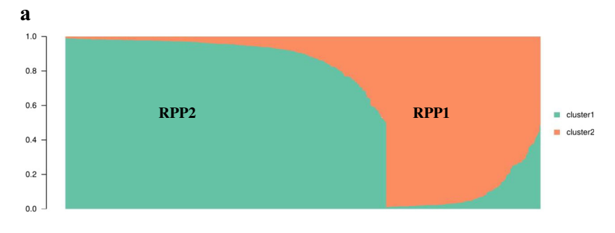
Fig. 2 a Classification of 520 European chestnut genotypes, in reconstructed panmictic populations (RPPs) when K = 2. based on the 18Unik data set. In orange, genotypes from southeast of France and Corsica (RPP1). In green, genotypes from other regions (RPP2). b Table of assignment of sampling regions in RPPs when K = 2, based on the 18Unik data set. c Tables of pairwise Fst between RPPs using all individuals and strongly assigned individuals ( ql \ge 80\% ), when K = 2, based on the 18Unik data set