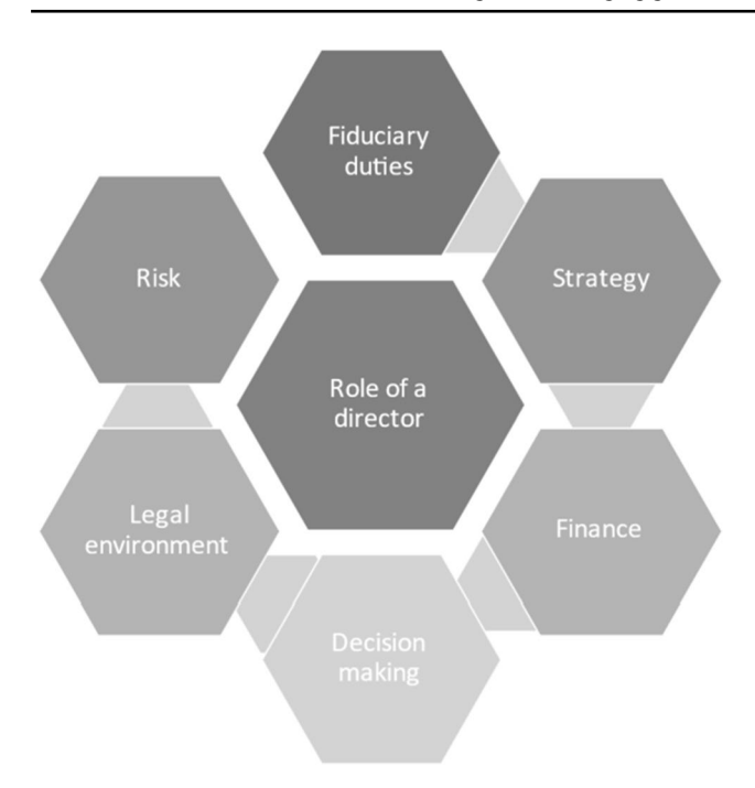
Fig. 1 The main elements of the roles of a non-executive director

depending on the organisation's specific requirements. Thus, the governance outputs of organisational performance, board effectiveness and director effectiveness will depend on the match between the board's intellectual capital and the roles required of it, and they have used this model as the basis of a diagnostic tool for measuring board effectiveness. This model, in its essence, forms the overall approach taken in structuring the current short review with selected parts of the model reviewed in the literature and then updated from the forum insights.