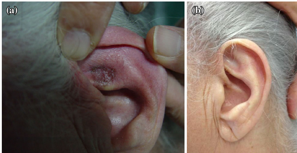
Fig. 1 A basal cell carcinoma localized on the antihelix of the ear and treated with photodynamic therapy. a Lesion before treatment. b Follow-up after 5 years