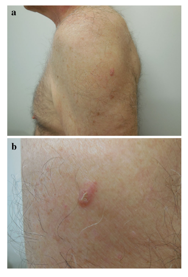
Fig. 1 Distant (a) and closer (b) views of the pneumococcal vaccination site on the left deltoid area show a 12 \times 5 mm linear, focally crusted, erythematous nodule

Microscopic evaluation of a 3-mm punch biopsy showed orthokeratosis, acanthosis, and a prominent granular layer. Dyskeratotic keratinocytes were present in the epidermis,