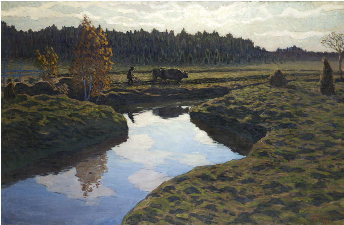
Fig. 1 Cultivation of a drained mire. ‘Autumn Ploughing in the Marshland’, painting by Ester Almqvist 1911 (photo Hossein Sehatlou). Gothenburg Museum of Art

The practice of setting aside part of the arable land for small-scale cultivation of vegetables and peas started during this period or possibly a few centuries earlier. However, according to official statistics, only 1 % of all arable land was used for growing peas/beans, and Morell (1998) states that a fair fraction of this land would have represented contract cultivation in Southern Sweden (i.e., not for local consumption). Moreover, peas and beans do not grow well on soils rich in organic matter.