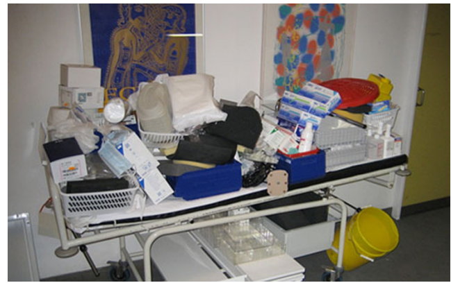
Fig. 1 “Left-overs” after applying the five S's to the CT rooms

SMED (single-minute exchange of die) SMED is used to reduce changeover time between the patients. The examination time must be separated into internal and external steps. Internal steps must be carried out on the CT system, and the external steps can be carried out elsewhere. We have found out that the total examination time was too long compared with the imaging time.