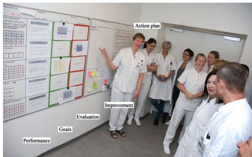
Fig. 4 Extended kaizen meeting with the MRI team

got involved, almost enthusiastically working with Lean, while some of the mid-level managers, i.e. the consultants and the superintendent radiographers, were more critical. Being the heads of the department, we were the first to be introduced to Lean. We had to learn to let go of part of the control and command. However, the mid-level managers seemed to have even more at risk. The normal top-down commands had changed with the Lean method. Suddenly the ideas of the youngest staff were just as valuable as the ideas of the senior consultants, and the proposals from the staff could even imply change in how the consultants had to work if it was of benefit to the patients and the workflow. It seemed that Lean created not just a change in culture but could even create a change in influence on the work and in personal authority, a challenge we had to take into consideration [5, 6].