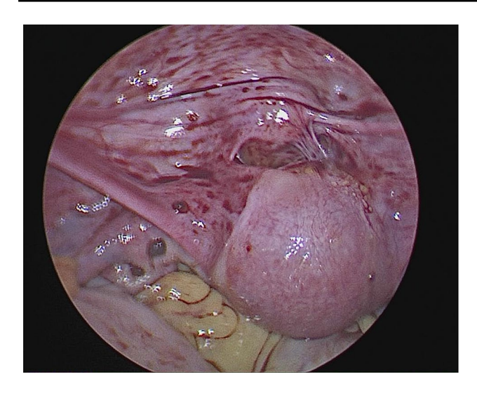
Fig. 1 Uterus seen seperated from the cervix