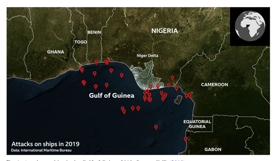
Fig. 1 Attacks on ships in the Gulf of Guinea 2019.

There is an understanding that piracy, like the slave trade, may have largely disappeared in modern times or at least plummeted to levels that would not draw the attention of the international community (Kontorovich 2009). However, this is not the case in the Gulf of Guinea, which is not only one of the world's top oil and gas exploration hotspots, but sadly, a new and dangerous area to shipping, especially around the Nigerian littoral