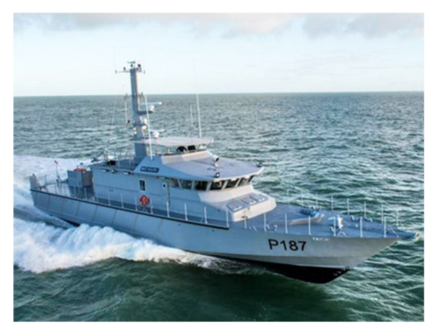
Fig. 5 Nigerian Navy Vessel.

counter sea piracy in Nigeria and the Niger Delta through the provision of speed boats to the Nigerian Navy. There will be more discussion on Fig. 5 later.