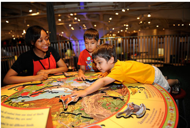
Fig. 1 Students explore "Charlie and Kiwi's Evolutionary Adventure" at the New York Hall of Science.

We have a separately funded program through which every single first grader in Ithaca comes to the museum. The class gets a pre-visit from a museum educator, a visit focused on dinosaurs, and a post-visit from a museum educator. First graders are crazy about dinosaurs, of course!