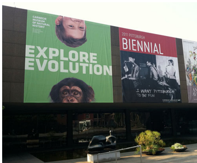
Fig. 3 Banner advertising the Explore Evolution exhibit at the Carnegie Museum of Science.

Kansas at Lawrence, the University of Michigan at Ann Arbor, and the University of Texas at Austin. A fifth exhibit currently travels around the United States. Teachers use the exhibits in innovative and substantial ways. Several religious groups in Nebraska regularly bring high school students to visit the Explore Evolution gallery. These students are given the opportunity to be introduced to evolution in a context where they can obtain accurate and accessible information about basic principles and current research on evolution. Some teachers bring their students to the Explore Evolution gallery because they do not have the institutional support to present evolution in their classrooms. For these teachers, the museum is perceived to have more substantial community support for teaching evolution than does their own school.