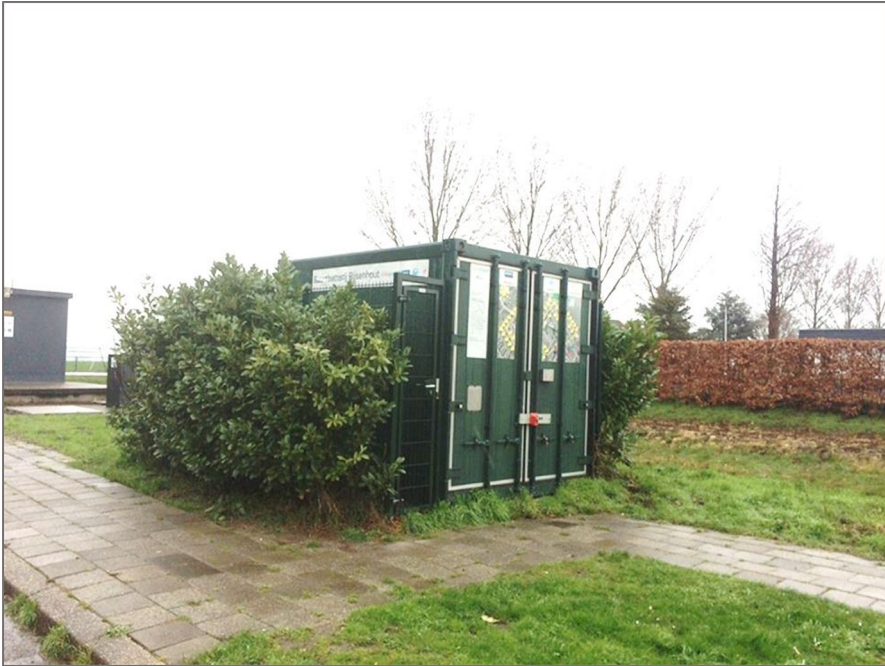
Fig. 3 The external appearance of the community battery.

influence decisions on the aesthetics of the battery container: the color, the exact location, and the planting of bushes around it.