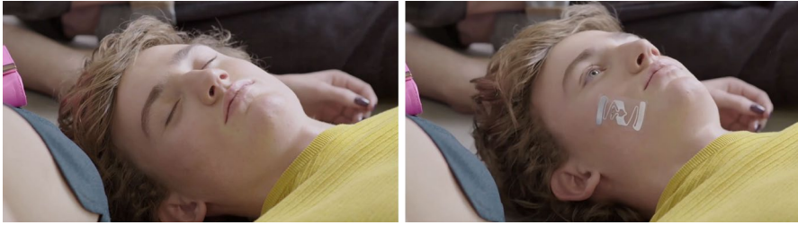
Fig. 4 Switching the ontological status through being tagged

for questions of accountability and responsibility, which will be discussed later. And it does something else yet: the establishment of an RFID infrastructure enables the four-dimensional traceability and control of items. If an object is tagged and readers are in place, the object becomes traceable; it is possible to locate it in the space that has been established and to track its movements back and forth through time. At this moment, the people are still untagged humans, motionless and in chaos. For the invisible infrastructural geography to be in full effect, another transformation is needed.