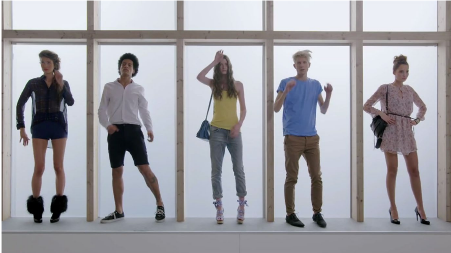
Fig. 6 Disciplined activity

expressions and even emotions are tamed and linked to the space and time they find themselves in.