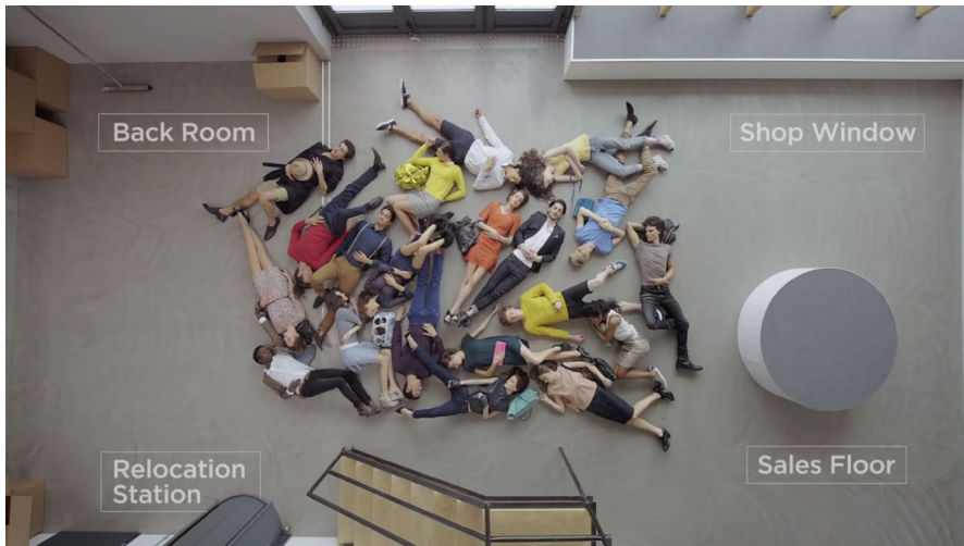
Fig. 3 Invisible infrastructural geography

In the end, the viewer is shown that without technological support, only a very limited section can be overseen and controlled. The complexity that goes beyond what is visible to the naked eye is overwhelming—both physically and emotionally. Trying to bring order into the chaos seems to be a virtually impossible chore. The question thus stages the problem to be solved, but it goes further: it also produces the target group, members of a corporation who have to manage chaos and want to control their shop floor, their supply chain or their inventory processes.