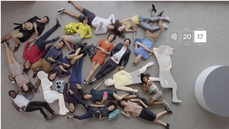
Fig. 5 Counting and accounting

three people in the group are represented as transparent (Fig. 5) and motionless until they receive their tag and thus their individual identity. The objectification of human bodies and the tight coupling of tags and infrastructure opens a space in which everything that is present can be counted, managed and controlled. The only things that truly count in such an environment are those that can be read and localized. The others, the ones that cannot be accounted for, are outlaws, grey silhouettes. If something cannot be read and counted, it does not fit in; it is a foreign body that disturbs the imagined and desired purity of the space and needs to be taken care of—either by being removed completely or by being tagged and thus made legible and countable. Having everything tagged is a central value and points to the imagination of perfect order tied to RFID infrastructures.