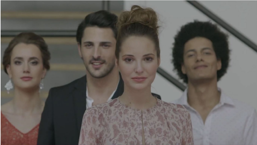
Fig. 8 Liberated people-items