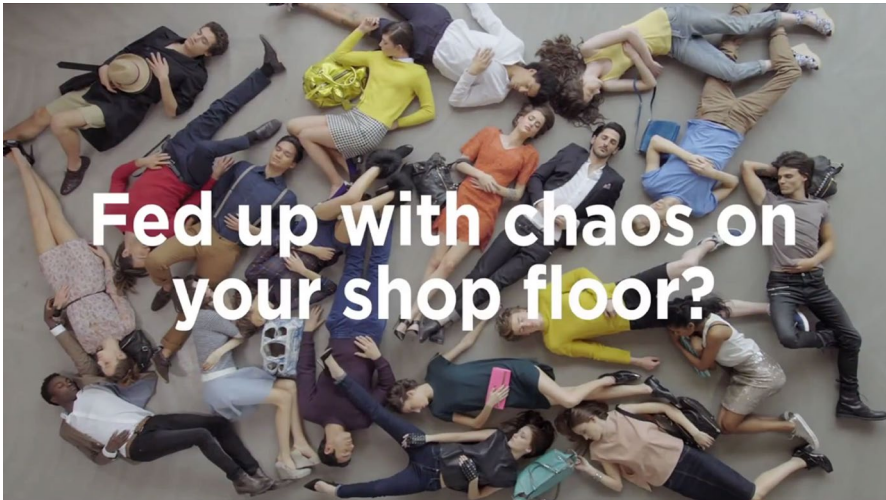
Fig. 2 Untagged disorder