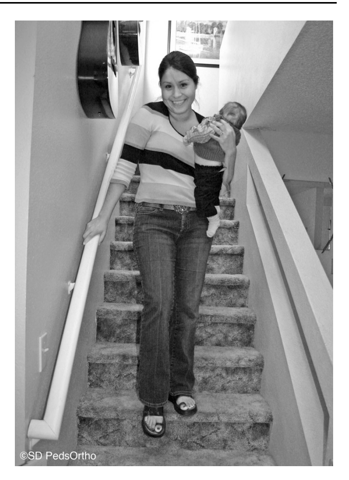
Fig. 3 The caregiver should hold on to the handrail while traversing the steps. In addition to using the handrail, the caretaker's view of the stairs should be unobstructed

Acknowledgments The authors would like to thank JD Bomar and Camila Avila-Bomar for their help with the drawings and photographs for this paper.