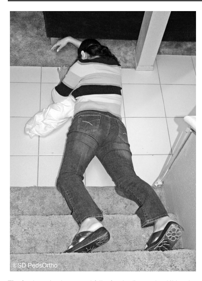
Fig. 2 They miss the step and fall, often landing on the child as they fall

on the opposite side of the body to the handrail. This ensures that the caretaker has a clear view of the steps. We hope that these recommendations serve to remind health-care providers as to the dangers of carrying children on stairways. At times this may be necessary, and can be performed safely if the proper precautions are taken.