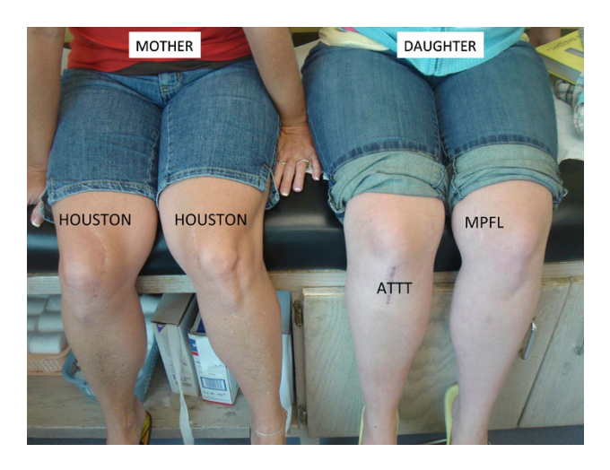
Fig. 4 There is a prevalence of torsional anomalies (femoral anteversion and/or outward tibial torsion) in females, and this is often familial. This mother and daughter, both with excessive outward tibial torsion, have undergone a variety of patellar stabilization surgery, but remain symptomatic

reconstructive endeavors of the orthopedic sports medicine and adult reconstruction specialists [5, 13-15] (Fig. 4).