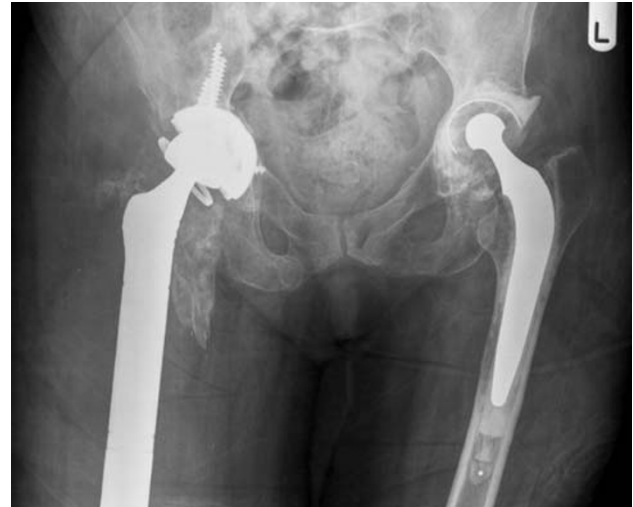
Fig. 5 Postoperative direct exchange right total femoral replacement for patient in Fig. 3, showing proximal prosthesis

chronic draining sinus in the knee (patient C). Two patients (patients B and C) had previously had extensive surgeries in the whole femur, which again failed secondary to sepsis. Subsequently, these two patients were treated with a total femoral replacement.