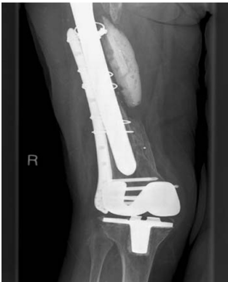
Fig. 4 Preoperatively infected metalwork right femur with osteolysis showing distal femur for the patient in Fig. 3

chronic draining sinus in the knee (patient C). Two patients (patients B and C) had previously had extensive surgeries in the whole femur, which again failed secondary to sepsis. Subsequently, these two patients were treated with a total femoral replacement.