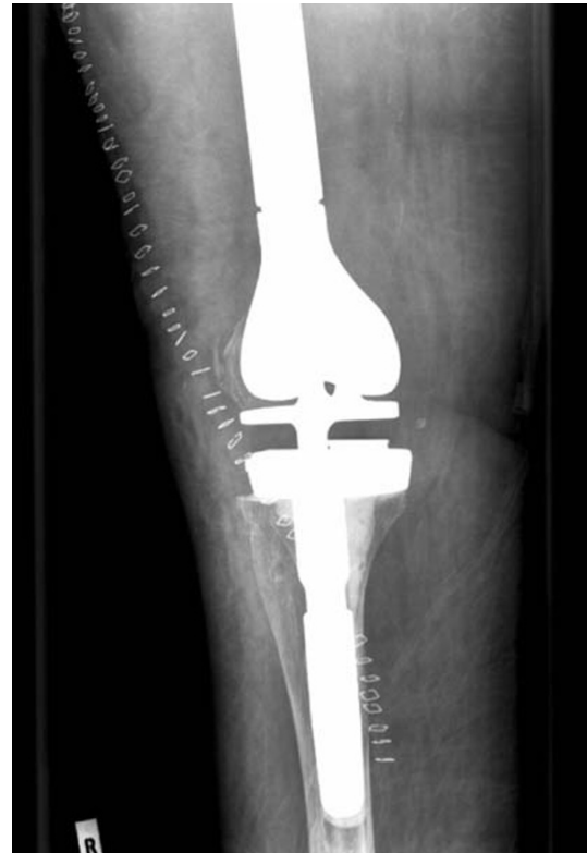
Fig. 6 Postoperative direct exchange right total femoral replacement for patient in Fig. 3, showing distal prosthesis

The presence of infection was confirmed by a positive culture of joint aspirate or by intraoperative culture, or both, in addition to inflammatory changes [18]. Infection was diagnosed microbiologically when more than one tissue culture revealed similar organisms. Pre- and postoperative pain and functional assessments were assessed using the Oxford knee scoring system.