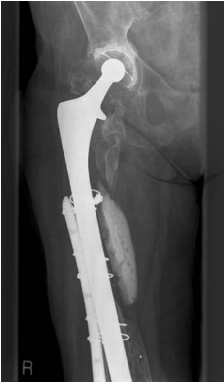
Fig. 3 Preoperatively infected metalwork right femur with osteolysis, showing proximal femur