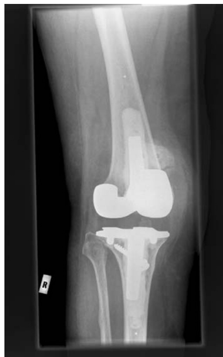
Fig. 1 Preoperatively infected right revision knee replacement with osteolysis

Between March 2003 and December 2007, six direct exchange arthroplasty procedures (four distal femoral replacements and two total femoral replacements) with tumour prostheses were performed for chronic periprosthetic knee infections associated with severe bone loss (Figs. 1, 2, 3, 4, 5, 6) [3]. This was a retrospective review of prospectively collected data. Chronic infection was defined as persistent infection greater than 1 month from the index operation. Four patients (patients A, D, E and F) had infected knee prostheses (and underwent distal femoral replacements) and two patients (patients B and C) had combined infected hip and knee prostheses (Table 1). These two patients underwent total femoral replacements. All patients were managed in collaboration with the infectious diseases department at our institution. The cohort had one male and five female patients. At clinical presentation, all patients were wheelchair-bound secondary to pain and instability. Radiographs revealed a failing