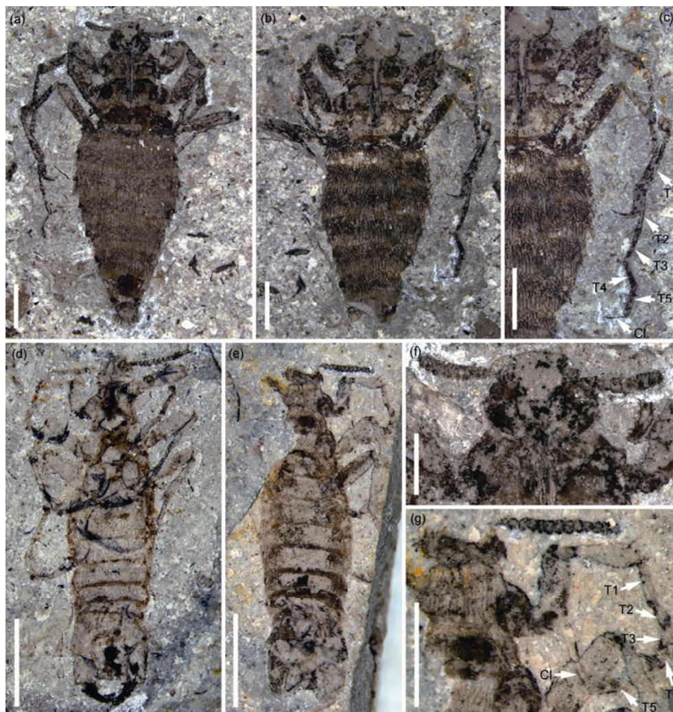
Figure 1 The Middle Jurassic giant flea Pesudopulex wangi sp. nov. from Daohugou, Ningcheng County, Inner Mongolia. Scale bars represent 1 mm in (f) and (g), 2 mm in (a)–(e). (a) The part of holotype (NIGP154244 a), a complete female showing the general habitus; (b) the counterpart (NIGP154244 b) of holotype; (c) enlargement from (b), showing details of the meso- and metatarsi; (d) allotype (NIGP154245), a complete male, showing the general habitus; (e) paratype (NIGP154246), an incomplete male, showing the general habitus; (f) enlargement from (a), showing details of the female head; (g) enlargement from (e), showing the antenna and fore legs of the male. T1–5, tarsomeres 1–5; Cl, claw.

Description. Female, 14.8 mm long; body spindly in shape, widest section at abdominal segment IV (Figure 1 (a)). Head relatively small, more or less rounded; antennal socket developed; antenna 16-segmented, distinct compact, scape large, pedicel conical, flagellum short, widen backwards, broadest at middle section, rounded at apex (Figure 1 (f)); compound eyes moderate large, close to antennal socket; ocelli absent; mouthparts extending to base of metacoxae (Figure 1(b)), maxillary lacinia armed with tiny denticles (serrations), labial palpus with four fused palpomeres, as