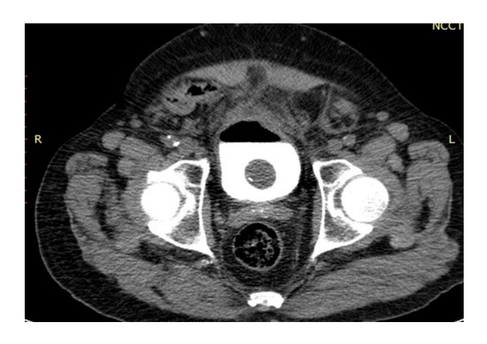
Fig.2 In the same patient, CT cystogram axial view with post indwelling urethral catheter for 10 days after the initial presentation showing the contrast in the UB with resolving of the extravasation

and trivial perforations which sometimes are not visible to surgeons [9]