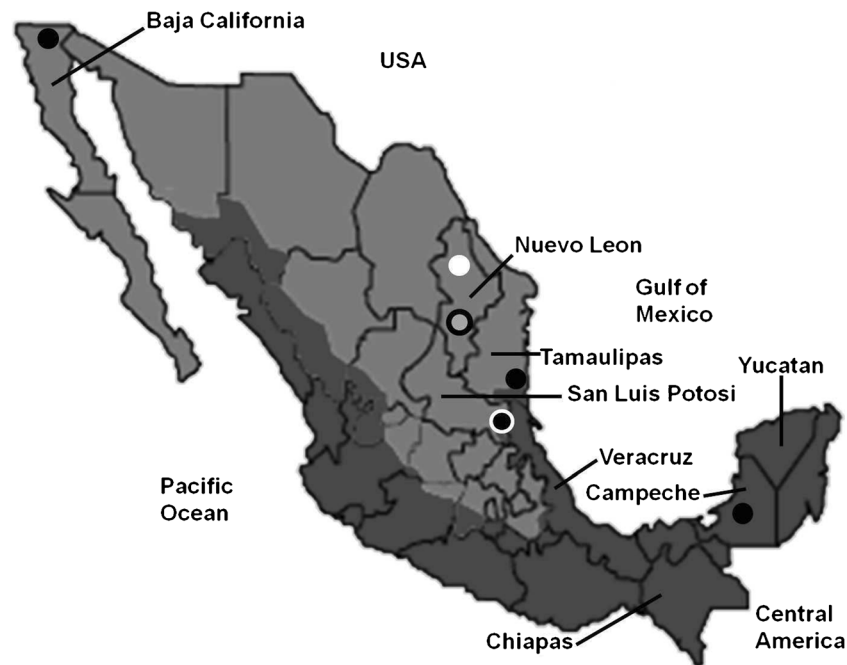
Fig. 1 Map of Mexico. BPR control zones are depicted in darker colour ; these zones harbour vampire bats. Those states included have been referred in the text. Black dots are confirmed with BPR outbreaks (Note: the outbreaks in Aldama and Mexicali are not described in text but included in map). The white dot corresponded to a confirmed botulism outbreak (outbreak 4, Sabinas Hidalgo, Nuevo León). The black dot with a white

outline refers to a BPR outbreak (outbreak 2, Tamuin, San Luis Potosi) and to other different outbreak occurring in the same area in which there were both BPR and botulism (outbreak 3 Tamuin, San Luis Potosi). The gray dot with a black outline corresponds to the last outbreak, which is a concomitance of both PEM and BPR (outbreak 5, General Escobedo, Nuevo León). The map was modified from the original source: FAO/SAGARPA 2007