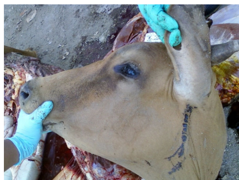
Fig. 4 Bleeding bites inflicted by vampire bats in a confirmed case of BPR (outbreak 2, Tamuin, San Luis Potosi)

TME should also be properly investigated in outbreaks of bovine neurological diseases. For instance, two fattening