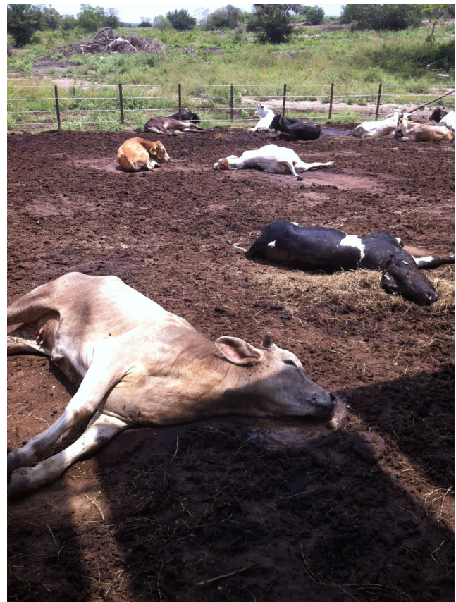
Fig. 2 Prostrated animals from the same pen showing signs consistent with botulism. However, in this ranch, a BPR-positive case confirmed by FAT occurred previously in a grazing heifer. The zone is within the risk areas for BPR (outbreak 3, Tamuin, San Luis Potosi)

This outbreak of feedlot mortality (62.5/1,000) appeared in Sabinas Hidalgo, Nuevo Leon (Fig. 1), where affected animals showed signs of paralysis and prostration. Sabinas Hidalgo is in an arid region unsuitable for vampire bat life, and in the state of Nuevo Leon, BPR had not yet been reported (Lee et al.