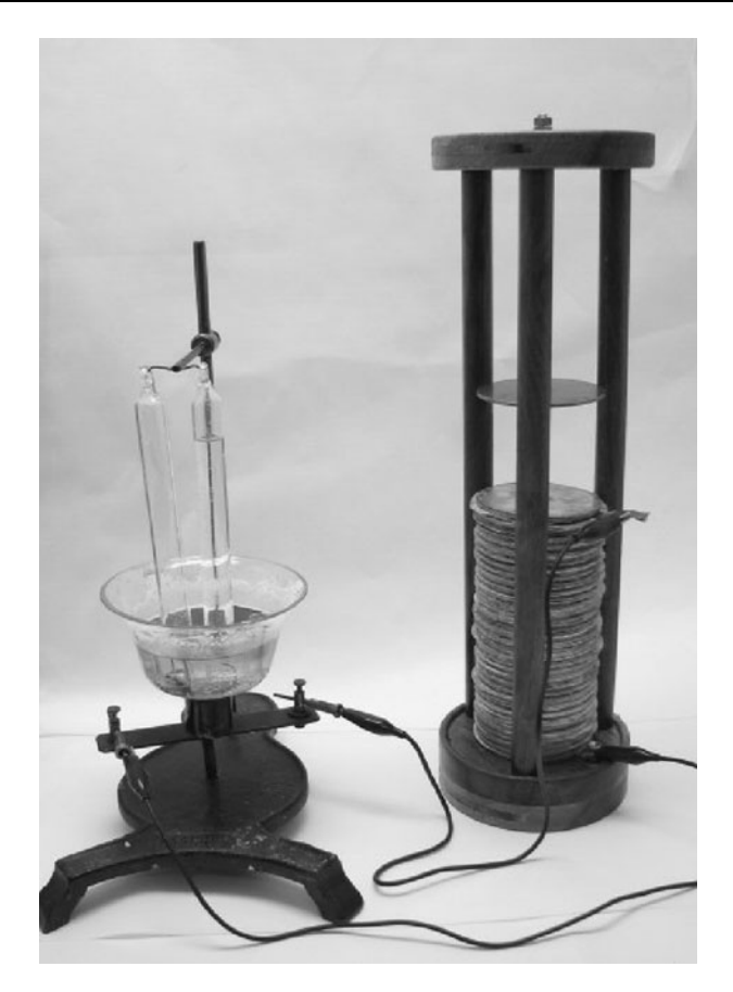
Fig. 2 Ole Georg Gjøsteen's apparatus for the decomposition of water connected to a voltaic pile. Note that the left hand test-tube is full of hydrogen, whilst the right hand test-tube is approximately 1/5 full of oxygen

sources claim this is easy, but with some practice we approached this ratio.<sup>7</sup> Then other duties called and the pile was left for some weeks before we returned. To dismantle it, we found that the most useful utensils were a hammer and chisel. The whole column had become as hard as concrete. Rereading Volta was of no help, the only problem he mentions is that of a too dry column, which he kindly suggests should be re-humidified. Our pile was put to swim in various solutions without much effect. Somehow Volta never mentions dismantling the pile, and we now understand why.<sup>8</sup> But we wanted our students to re-build