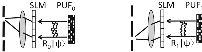
Fig. 1 A single SLM configuration can verify q distinct responses. Example for q = 2

response states are transformed to random speckle which typically does not lead to a detection event.) The price to pay is that the efficiency of the SLM transform is reduced by a factor q , i.e., photons are lost.