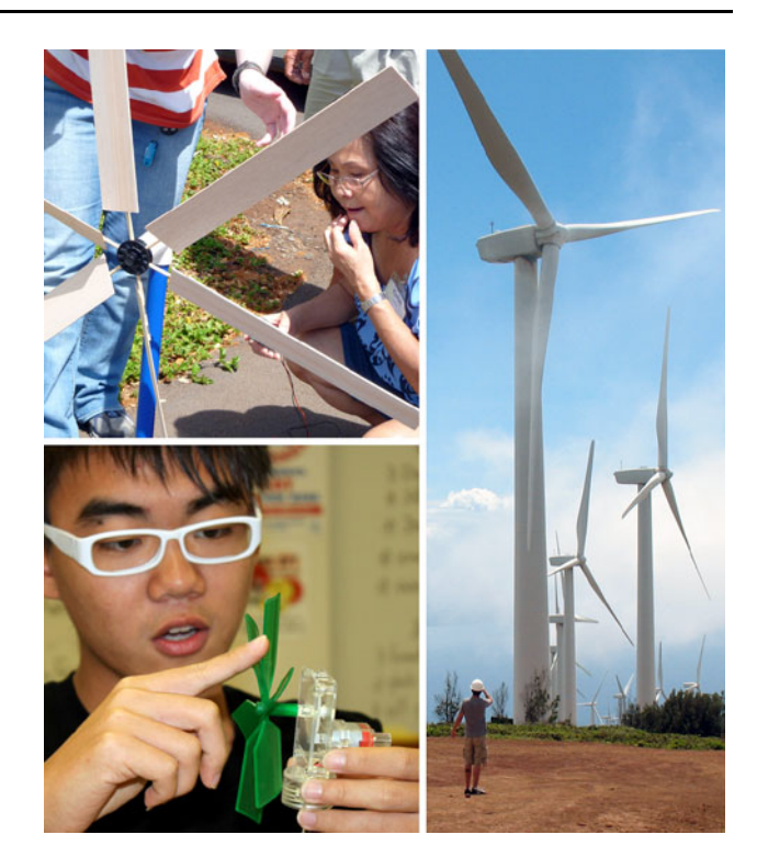
Fig. 3 ( Right ) Teachers learn about wind turbines from a local wind energy expert. ( Top Left ) Teachers construct a wind turbine using their teacher supply kits in the TSI Energy workshop component of the PD. ( Bottom Left ) A student assembles a wind turbine prototype as part of his teacher's PD implementation in high school (9–12th grade) digital media class

Teachers' use patterns of the recorded expert presentations from their own PD workshops also showed a relatively even distribution, with slightly higher levels of use of wind energy resources, (this may be due to the fact that the wind energy PD component had two lessons (pinwheels and wind turbines) and that the wind turbines were the