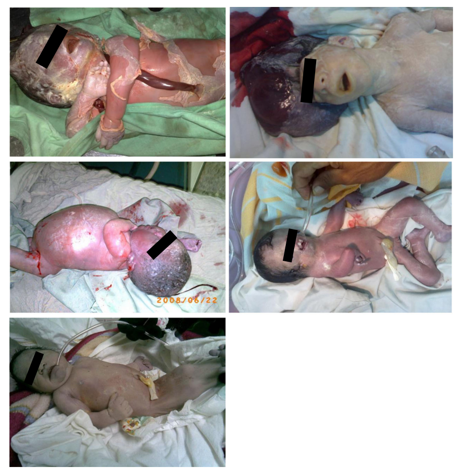
Fig. 3 Selected photos of children born in Fallujah between 2008 and 2010, showing severe neurodevelopmental disorders, in the form of multiple birth defects

the 1960s. It is favored because it weighs less than other metals and it does not rust. It is estimated that about 55 % of the Ti manufactured in North America is utilized in the military and aerospace industries. Titanium is used extensively in US weapons systems,