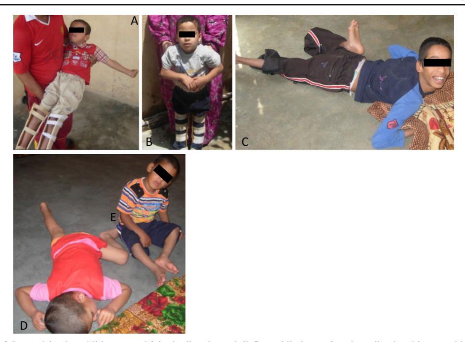
Fig. 2 Photo of the participating children: a and b brain disorder and disfigured limbs; c, d, and e epileptic with general body seizures