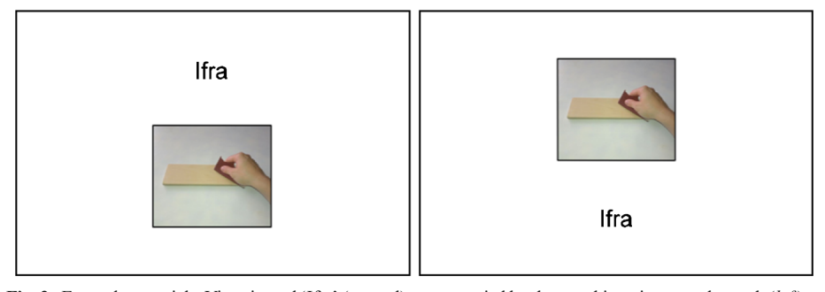
Fig. 2 Example materials. Vimmi word 'Ifra' (to sand) accompanied by the matching picture underneath ( left ) or above ( right ) the word

Apparatus and Materials The words and pictures were the same as those used in experiment 2, but the definitions were now presented in Dutch. The Vimmi words and pictures were presented in SMI Experiment Center (version 3.3; SensoMotoric Instruments) on a monitor with a resolution of 1680 \times 1050 pixels (see Fig. 2). Pictures were 500 \times 400 pixels; the centre