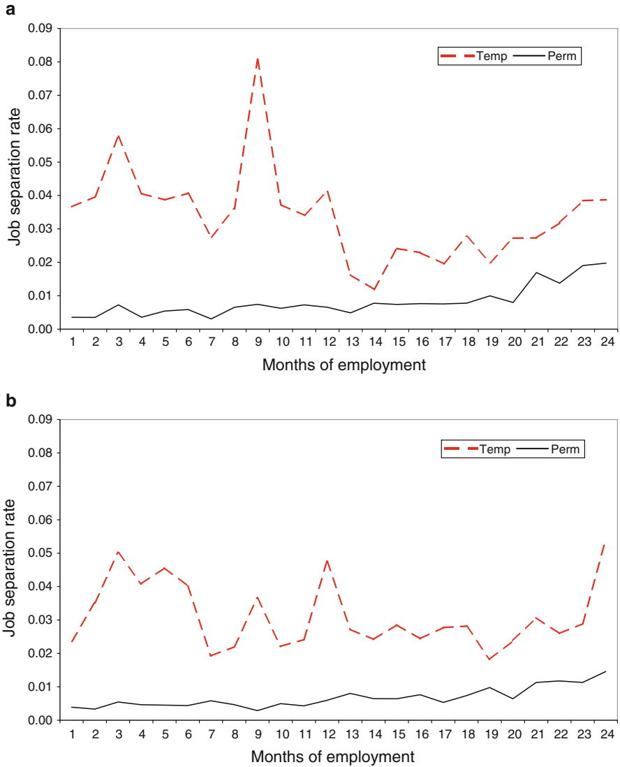
Fig. 3 Job separation rates—men (a) and women (b)

We assume that the unobservables in both job finding rates are from discrete distributions with two points of support, which we assume to be perfectly correlated. 16 Then, the joint distribution also has two points of support, p_1 and p_2