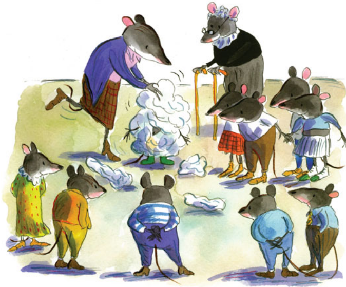
Fig. 1 “His mother, his grandmother, his brothers and sisters.” Reprinted with permission from De Vries-Brouwers (the publisher): Jeanne Willis and Tony Ross. Watje Wimpie . Antwerpen: De Vries-Brouwers, 2007

tot alleen zijn voeten nog uitsteken. Nu is hij Watje Wimpie.