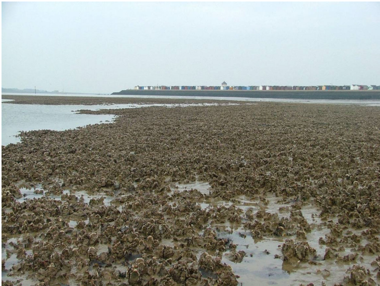
Fig. 2 Wild C. gigas reef that has established on intertidal mud on the Blackwater estuary at Brightlingsea (UK) in 2008