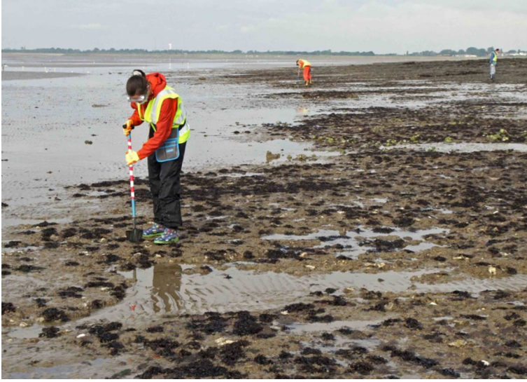
Fig. 4 Hand removal of C. gigas by volunteer workers on a protected chalk shore in Kent, south east England

Moreover, the density and spatial arrangement of Pacific oysters has been shown to affect the impact of wild settlement upon the native Australasian oyster Saccostrea glomerata (Wilkie et al. 2013). Although fishing activity creates different impacts and disturbances on intertidal benthic species and habitats (Hall and Harding 1997; Spencer et al. 1998; Kaiser et al. 2001; Piersma et al. 2001) and hand-collecting may disturb bird feeding at low tide (Goss-Custard et al. 2006), it is possible that the extent and intensity of these activities could be managed by acquiring licences. In the Blackwater estuary on the south-east coast of England, large areas of C. gigas ‘reef’ have been hand-picked ‘clean’ of wild oysters to create areas for re-laying oyster seed (Herbert et al. 2012). This seed does not grow to maturity to form reef but is either hand-collected or dredged and re-laid in creeks for on-growing. A variety of wading birds can feed in areas where oysters have been removed and amongst newly laid seed.