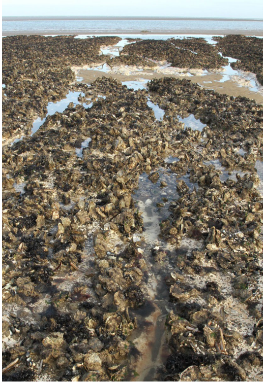
Fig. 1 C. gigas reef establishing on a chalk rocky shore in Kent, south east England