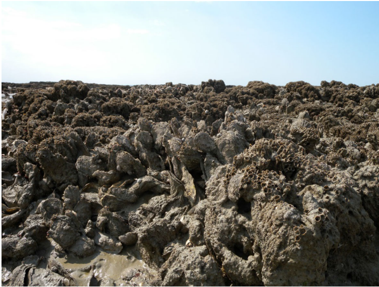
Fig. 3 Wild settlement of C. gigas on reef of Sabellaria alveolta . Bay of Mont-Saint Michel (France)

with high settlement of wild C. gigas (Markert et al. 2010), yet increasingly unsuitable habitat chemistry and anoxia associated with high rates of decomposition of biodeposits and microbial respiration is likely to be responsible for the suppression of species diversity at very high levels of C. gigas cover (Green et al. 2012; Green and Crowe 2013, 2014). Due to a sediment-free upper part of the reef and more turbulent current flow, species richness was significantly greater amongst the oyster beds compared to mussels and some faunal species were exclusively found on oyster beds, particularly anemones and suspension feeders (Markert et al. 2010). Higher species survival amongst the more complex oyster reef structure and bio-deposition of sediments was also thought to explain differences in species richness (Kochmann et al. 2008).