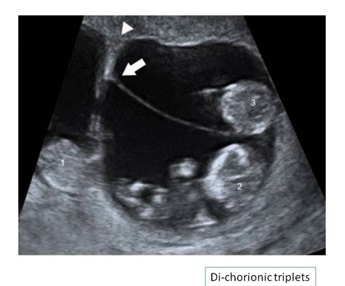
Fig. 3 Ultrasound picture of a dichorionic, triamniotic trio at 13 weeks gestational age. The arrow indicates the amniotic membranes of fetuses 2 and 3, which are a monozygotic pair. At this time, it is unsure if Fetus 1 shares zygosity with fetuses 2 and 3. Numbers indicate the three fetuses.

African populations have higher twinning rates, of about 12–18 in sub-Saharan countries and over 18 per 1000 in central African countries (Smits and Monden 2011). Thus, in Caucasian and sub-Saharan African populations, MZ twins comprise \sim 26 \% of all twins, whereas in Asian populations, MZ twins represent over half of all twins, and