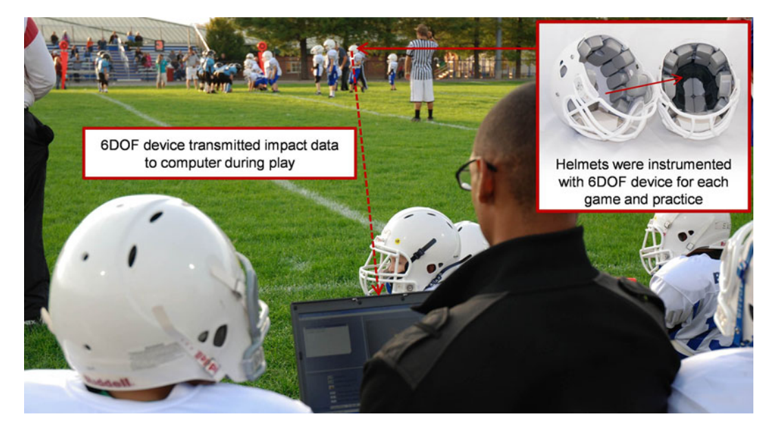
FIGURE 1. The helmets of youth football players were instrumented with the 6DOF head acceleration measurement device. Players wore instrumented helmets for every game and practice they participated in. Each time an instrumented player experienced a head impact, data were collected and then wirelessly transmitted to a computer on the sideline.

The 6DOF measurement device consists of 12 accelerometers and is designed to integrate into Riddell Revolution football helmets (Fig. 1). While the 6DOF measurement device was originally designed for adult Revolution football helmets, the device is compatible with youth helmets due to the same sizing conventions and identical padding geometries between adult and youth Revolution helmets. Instrumented helmets were worn by youth football players during each game and practice they participated in. Each time an instrumented helmet was impacted and an accelerometer exceeded a specified threshold, data acquisition was automatically triggered. A total of 40 ms of data from each accelerometer were recorded, including 8 ms of pre-trigger data. Once data acquisition was complete, data were wirelessly transmitted to a computer on the