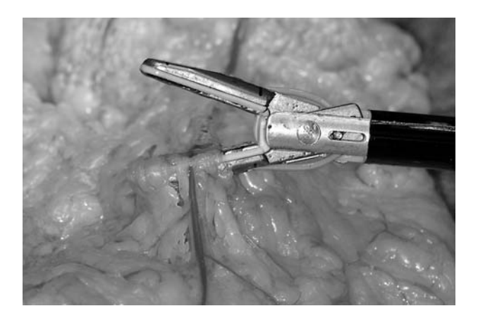
Fig. 2. Image of Ligasure<sup>®</sup> technology for vessel sealing. Image shows vessel of greater omentum before closing the branches of Ligasure<sup>®</sup> for sealing and dissection, as described in the text