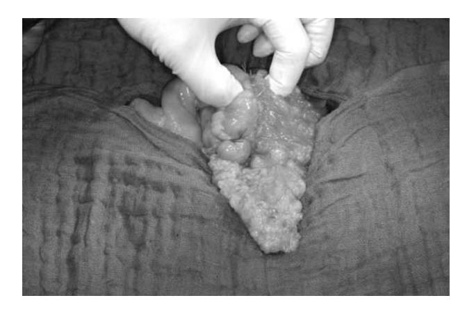
Fig. 3b. Digital examination of anastomosis for proof of absence of stenosis

Complications can often be prevented by adequate exposure of the surgical field. Traction and counter-traction comprise the key for precise dissection. However, excessive traction in the area of the left colonic flexure may inadvertently injure the spleen. In slender patients, correct dissection lines of the bowel mesentery are best determined by transillumination. In very obese patients, digital palpation of the vessels can help avoid damage. Avoiding tension on the anastomosis or stoma site can be prevented by good mobilization of the bowel (Figs. 3a and b). If a stoma is required, obese patients in particular may present problems with the blood supply to the ostomy limb, which can easily lead to retraction and/or necrosis of the stoma [99, 100].