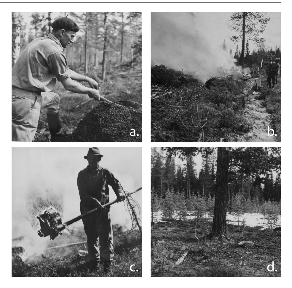
Fig. 3 Different steps of the prescribed burning system carried out under Wretlind: a burning anthills; b burning along a firebreak; c lighting the fire with a birch-bark torch; d Scots pine saplings growing around a seed tree.

burning practitioners, and too expensive when carried out on small stands (Ebeling 1959). Both clear-cutting and prescribed burning were controversial methods that went against the watchword of carefulness that prevailed in the forestry industry at the time (Öckerman 1998). Wretlind had to convince his superiors, who were skeptical about his methods, that they were the only way to ensure forest regeneration in the interior of Lapland and to let him carry out his trials: