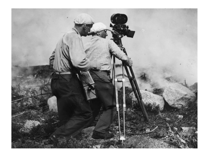
Fig. 4 A photograph taken during the filming of a movie in 1947 on prescribed burning in Malå: "Photographer Gustavson at the camera, and an assistant from Malå." Source Table 1: W-photographs

Even after he had proven himself, and after he retired in 1951, Wretlind continued to promote prescribed burning. For example, in 1955, Wretlind was asked to provide feedback on a circular letter about safety measures to be employed during prescribed burning. In his answer, Wretlind argued that prescribed burning had proven to be an indispensable regeneration measure and therefore should not be "either discredited or unnecessarily complicated by superfluous rules" (Table 1: W-DH-letter-1955). Irrespective of the debates and disagreements that Wretlind could trigger, he succeeded in convincing the forestry community, and in the following decades, his methods have been widely applied by both private owners and forestry companies in Malå district and also across the whole of northern Sweden (Jonsson 1965; Kardell 2004). Wretlind was made a member of the Royal Academy of Agriculture and Forestry, a commander of the Order of Vasa and an honorary doctor at the Royal Forestry Institute in 1957 (Öckerman 1998). He was recognized as the forerunner of the prescribed burning technique that came to be an essential step in the regeneration of northern Sweden's raw-humus forests (Ebeling 1959; Jonsson 1965).