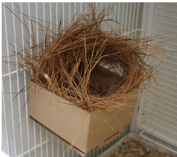
Fig. 1 Photograph of a nest constructed by a pair of zebra finches in our laboratory.