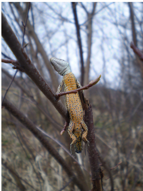
Fig. 1 Fresh impaled adult common lizards, L. vivipara

GLM main effect ANOVA showed the following results (intercept: SS = 51.83 , df = 1 , MS = 51.83 , F = 8.65 , P = 0.005 ; Table 1). Male-biased predation was not affected by territory or year of study ( SS = 119.43 , df = 25 , MS = 4.77 , F = 0.64 , P = 0.83 ; SS = 8.10 , df = 2 , MS = 4.05 , F = 0.55 , P = 0.58 ; respectively). Thus, the higher predation risk experienced by males of the common lizard was not influenced by the hunting of individual shrikes. However, there was a significant difference between the number of males and females among impaled individuals ( SS = 41.72 , df = 1 , MS = 41.72 ,