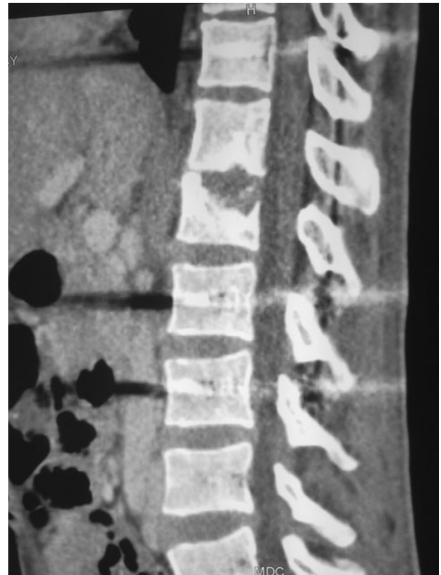
Fig. 3 Computed tomography scan 12 months after surgery. Apposition of new bone tissue in T12, improved bone quality of L1, and maintenance of screws positioning