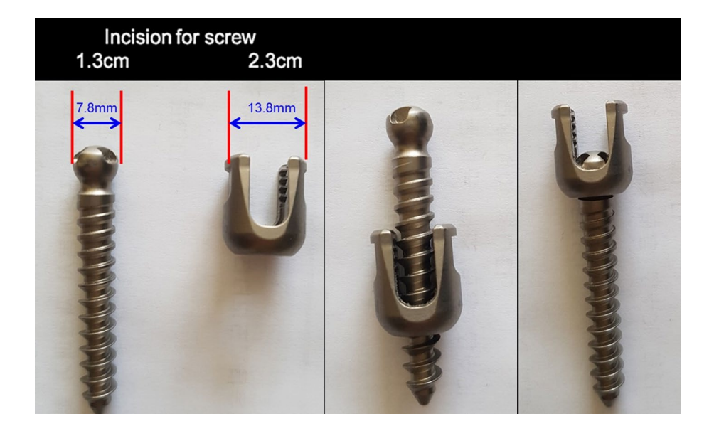
Fig. 4 Specially designed telescoping screw. Specially designed screws were used where additional skin incisions were needed due to anatomical limitations and trajectory of pedicle screw. After inserting the guide wire, connect the screw head and body to the guide wire. As the screw body inserted into vertebral body, it is automatically coupled to the head. For this reason, the screw can be inserted with a skin incision of about 7 mm (size of screw body itself)

In clinical evaluation, the average preoperative SRS-22 score was measured as 3.9 (range: 3.5-4.4) and it was improved to 4.2 (range: 3.2-4.7) (p < 0.001). All clinical outcomes are summarized in Table 2.