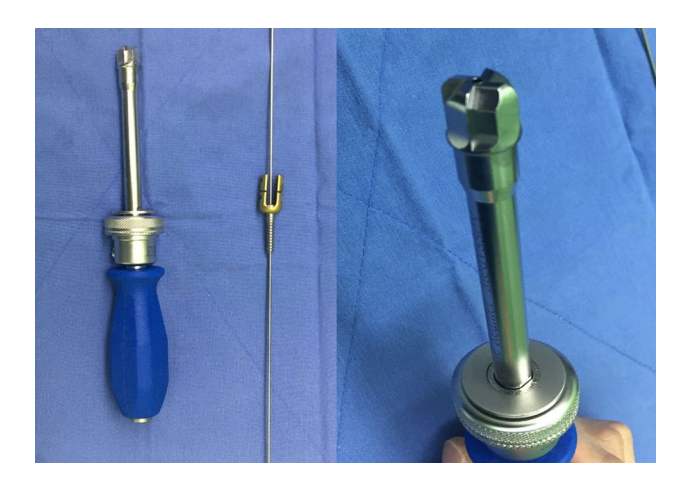
Fig.3 Specially designed cannulated facet miller which encompass adequate grinding of facet joints. Specially designed cannulated facet miller grind over facet joint with the help of guide wire