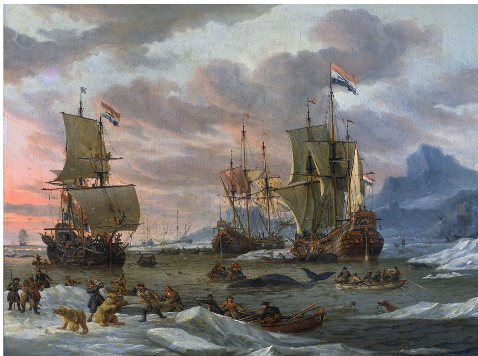
Fig. 1 European whaling for bowhead whales off Spitsbergen, Svalbard. http://en.wikipedia.org/wiki/File:Abraham_Storck_-_Walvisvangst.jpg . Abraham Stork, Rijksmuseum Amsterdam

characterizes the Barents Sea (Sakshaug 1997). This level of production in high Arctic waters is the basis for a lipid-driven food chain, from diatoms via Calanus spp. to marine mammals and seabirds (Falk-Petersen et al. 1990). In the Svalbard area, nutrient-rich Atlantic Water flows northward along the western Spitsbergen margin (Helland-Hansen and Nansen 1909; Nøst and Isachsen 2003; Walczowski et al. 2005) and descends beneath the fresh, cold Arctic Water at the northwestern tip of Spitsbergen and subsequently flows along northern Svalbard, the European Arctic and Siberian margin at depths between 100 and 400 m. The density gradient between the relatively light Arctic and denser Atlantic Water generally prevents upwelling of the latter (Nansen 1902; Rudels et al. 1999).