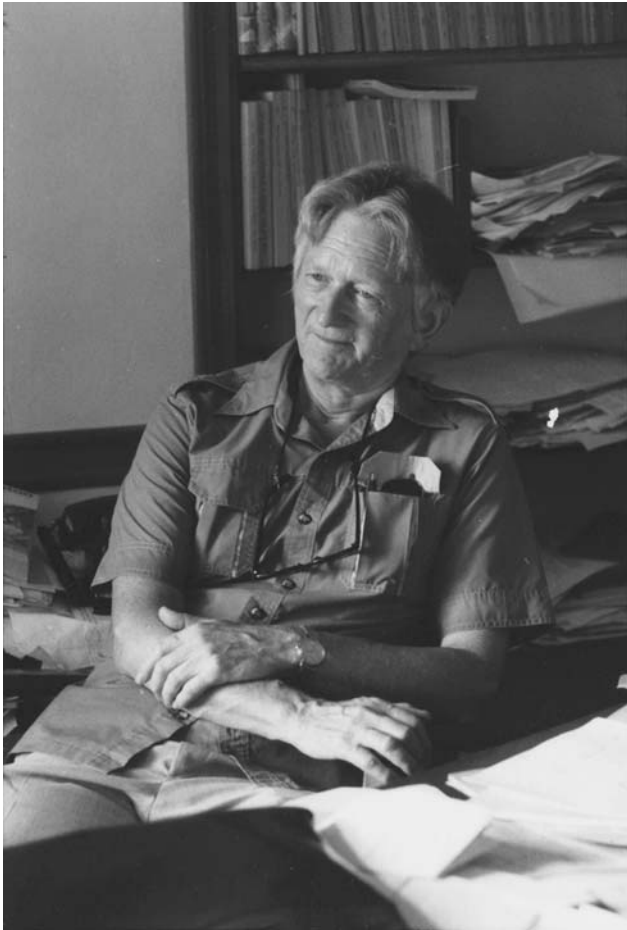
Figure 2. Atle Selberg, 1981.

Both were prodigies. Erdős (so the stories go), at age five, realizing that 250 less than 100 is 150 below zero. Selberg, at age seven, showing that the difference between consecutive squares is an odd number. They were both winners of the prestigious Wolf Prize. But in (at least) two ways, however, their mathematical styles were antipodal.