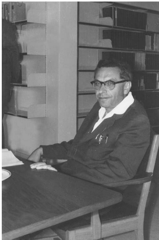
Figure 1. Paul Erdős. 1962.

Paul Erdős and Atle Selberg were both giants of twentieth century mathematics. They (Erdős 1913–1996, Selberg 1917–2007) were of the same mathematical generation.