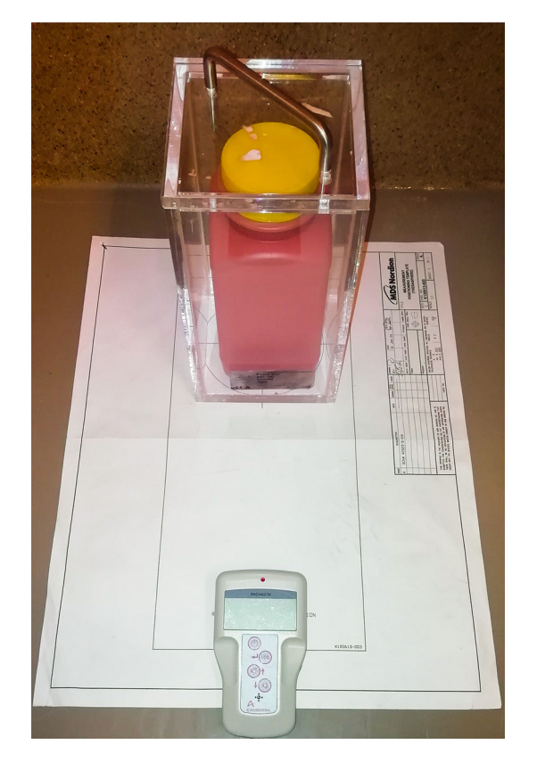
Fig. 1 Exposure rate of each waste container was measured with a dose rate and survey meter (Radiagem<sup>TM</sup> 2000, Canberra). The fraction of residual activity was based on the mean exposure rate of the V-vial before treatment and the waste container after treatment, measured three times from all four sides. This fraction was multiplied by the calibrated activity provided by the supplier, resulting in the residual activity. No perspex shielding was used; however, to correct for the absence of perspex shielding a representable sample of waste containers was measured with and without shielding. Using simple linear regression, a correction factor was applied to all measurements

To confirm the accuracy of PET/CT, two unused vials of glass microspheres with a known calibrated activity (14 and 8 GBq) were scanned at multiple time points until decay had dropped below 5 MBq. All waste containers were scanned with PET/CT (Siemens Biograph mCT time of flight system; Siemens Healthcare, Erlangen, Germany) within 36 h after treatment. Acquisition included 10 min per PET position with approx. 43% overlap for entire field of view. PET images were reconstructed using 4 iterations with 21 subsets, a 5 mm full width at half maximum Gaussian post-reconstruction filter and reconstructed voxel size of 4.1 \times 4.1 \times 3.0 \text{ mm}^3 . A co-registered CT scan was made for attenuation correction and to visualize the location of RA within the waste container. The waste container and V-vial were manually segmented, and activity recovery in each segmentation was calculated (ImageJ). By