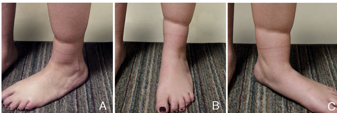
Fig. 1 A 36-year-old woman with constriction bands. a Lateral view, b . frontal view, c medial view

The results of this technique have remained largely stable and were documented photographically in a follow-up period of 9–18 months (Fig. 3). There were no complications.