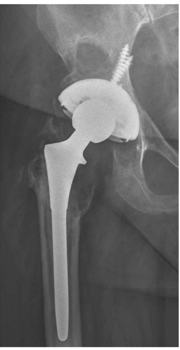
Fig. 3 AP radiograph of the right hip, pre-operatively

Publisher's note Springer Nature remains neutral with regard to jurisdictional claims in published maps and institutional affiliations.