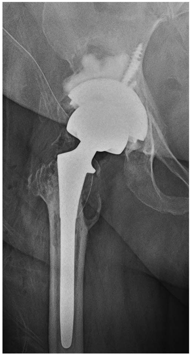
Fig. 2 AP radiograph of the right hip from 6 weeks earlier, immediately following revision total hip arthroplasty

Publisher's note Springer Nature remains neutral with regard to jurisdictional claims in published maps and institutional affiliations.