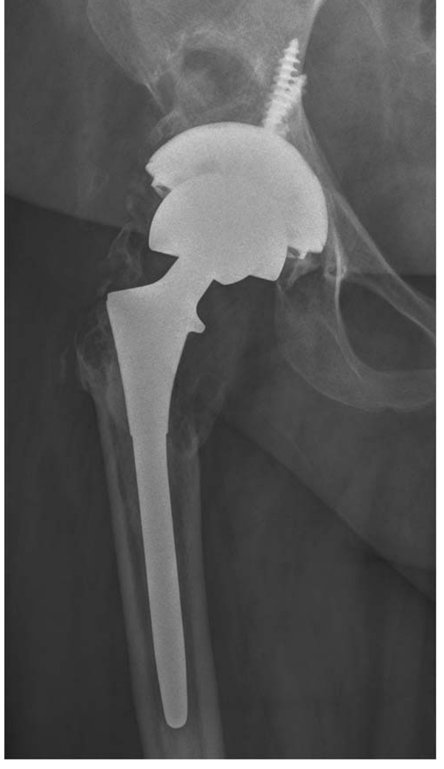
Fig. 1 AP radiograph of the right hip 6 weeks following revision total hip arthroplasty

68-year-old female seen in the orthopedic clinic for routine follow up 6 weeks following a revision right total hip arthroplasty for polyethylene liner wear induced osteolysis. The patient was asymptomatic at time of her 6 week postoperative follow-up (Figs. 1, 2 and 3).