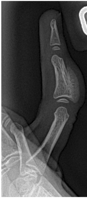
Fig. 1 Radiograph at initial presentation