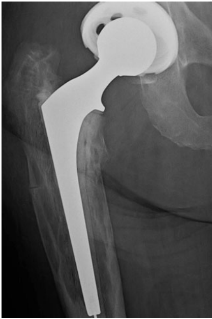
Fig. 4 Magnification view of frontal radiograph of right hip, taken 8 weeks after prior imaging. Patient underwent interval right total hip arthroplasty