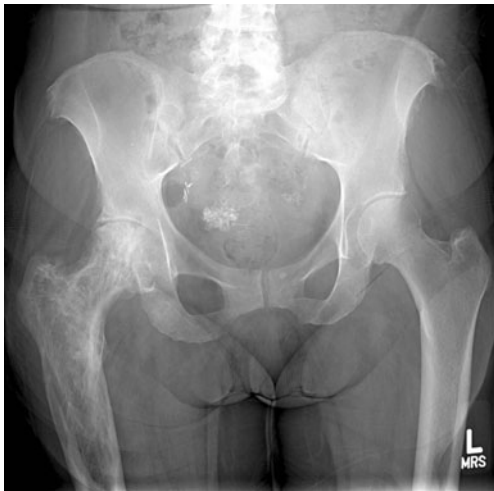
Fig. 1 Frontal pelvis radiograph

Sixty- eight- year-old female with 6 weeks of progressively worsening right hip/groin pain, now unable to ambulate (Figs. 1, 2, 3, and 4).