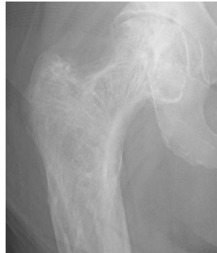
Fig. 2 Magnification view of frontal right hip radiograph